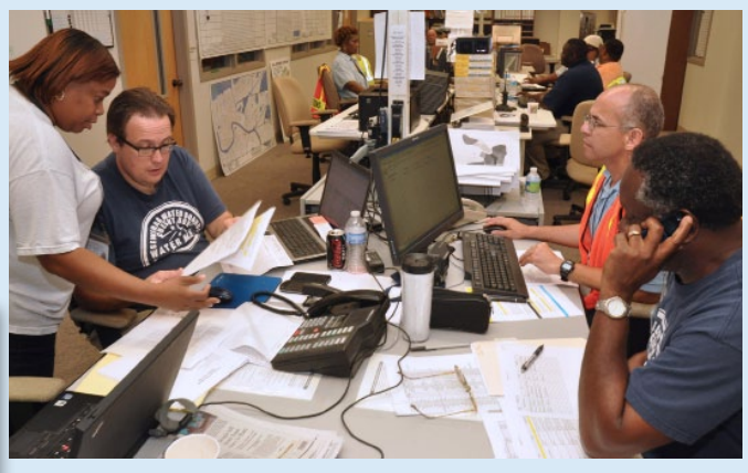
The Emergency Management Department holds regular table top exercises for various emergencies and the department remains ready to mobilize for hurricane preparedness with standard industry best practices for any potential disaster.

The Sewerage & Water Board joined with The Coastal Protection & Restoration Authority of Louisiana, the City of New Orleans and agencies across the metropolitan area for the annual hurricane preparedness press conference held June 1st at the Port of New Orleans. The press conference was the culmination of a coordinated, region-wide preparation effort. Grant said, "S&WB leaders met with the U.S. Army Corps of Engineers and its partners in flood protection, to ensure that coordination of operations and communications between the two were in place and tested. Preparation meetings and tabletop exercises and contingencies that are triggered when a hurricane/ tropical storm enters the Gulf have been completed."