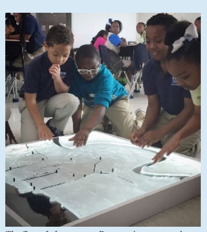
The Green Infrastructure Program is an approach to capture stormwater runoff, maintain healthy waters, provide multiple environmental benefits and support sustainable communities in New Orleans. The board dedicates competitive grant funds to be used by community groups for green infrastructure projects and activities.