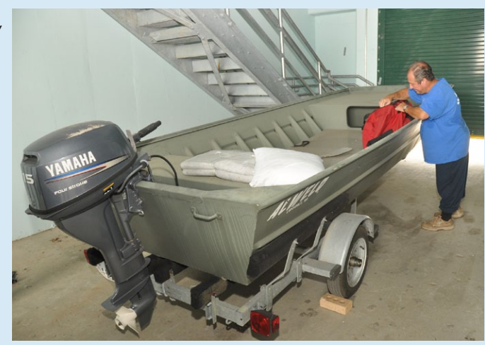
Faciilities have been equipped with boats to use for possible flooding.

At all of the many neighborhood, community, civic and business meetings S&WB teams attended, a prime concern of citizens was the Board's readiness for storms. Staff assured them that everyone knows what to do and when to do it and, yet, the Boards' plan was flexible enough to quickly adjust to unforeseen challenges. The citizens of New Orleans can be confident that the Boards' first responders are ready to go into action when needed.