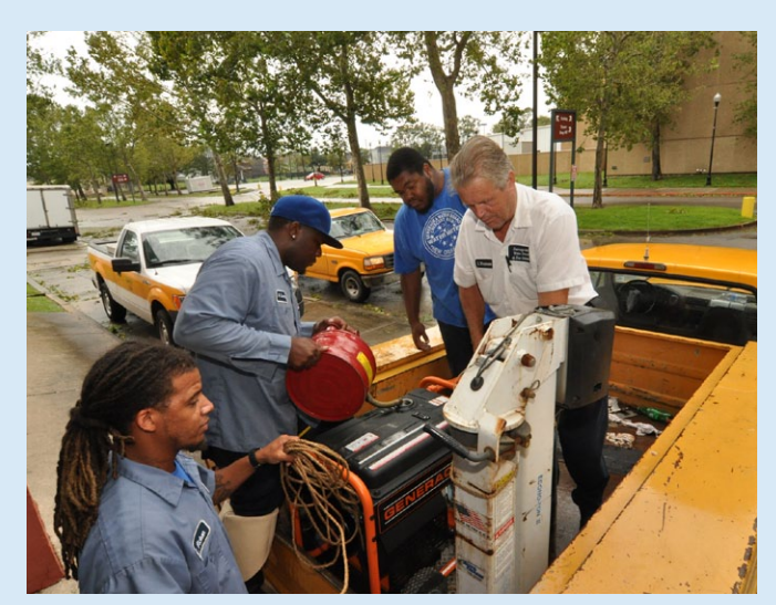
Essential board forces that "never leave" prepare for hurricanes, loading trucks with equipment and fuel.