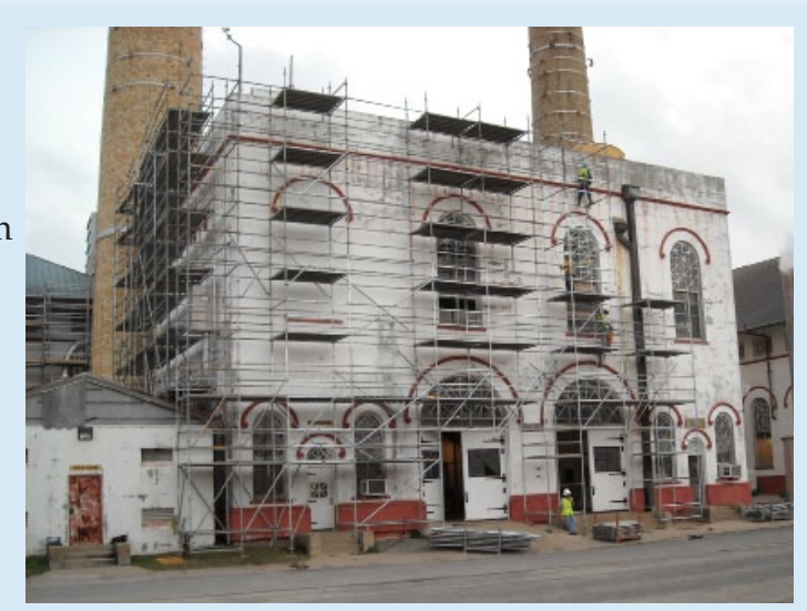
These storm proofing measures have been completed with the Power Plant Complex. These measures included, but not limited to, water intrusion protection, roof and wall reinforcement, strengthening of louvers, doors, shutters and ventilation systems and miscellaneous electrical and mechanical equipment storm proofing measures.

The generator gives the S&WB's Division of Pumping and Power the capability to improve the operation of its drainage, sewerage and water pumping systems in emergencies. The generator, funded 100% by the Corps, is part of a storm-proofing project for Orleans Parish. The project, located on the grounds of the Carrollton Water Purification Plant, costs in excess of $32 million.