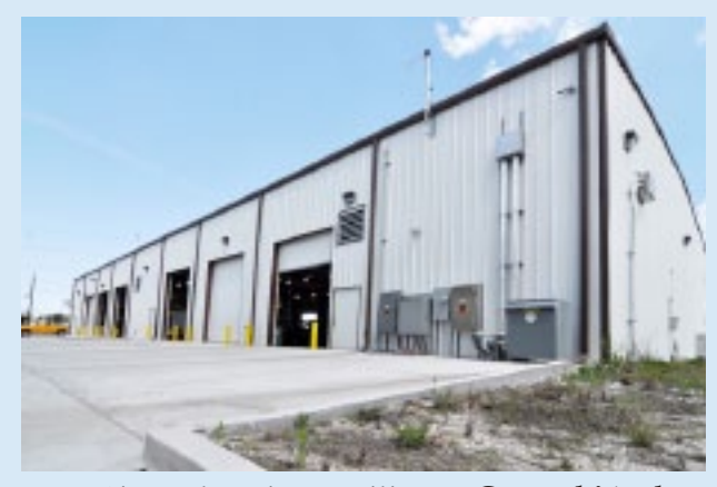
New Site Relocation Facility at Central Yard.

For more information, contact Community and Intergovernmental Relations, 504-585-2169.