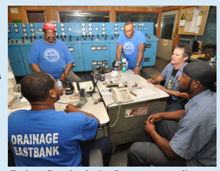
Drainage Pumping Station Operators meet to discuss storm preparations and plans on a continuous basis throughout the Hurricane season.