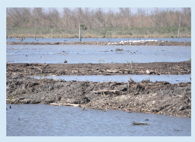
The Wetlands Assimilation Project, spearheaded by the Environmental Affairs Department, is an innovative partnership between the Sewerage and Water Board and the St. Bernard Parish government to restore 20,000 acres of Bayou Bienvenue. The bayou was severely damaged by Katrina's salt-water surge.

We have accomplished so much in the last ten years. And moving forward, we maintain our commitment to the relentless pursuit of progress. To that end, I predict that the Sewerage and Water Board as it marks its 116th Anniversary in August, 2015 will