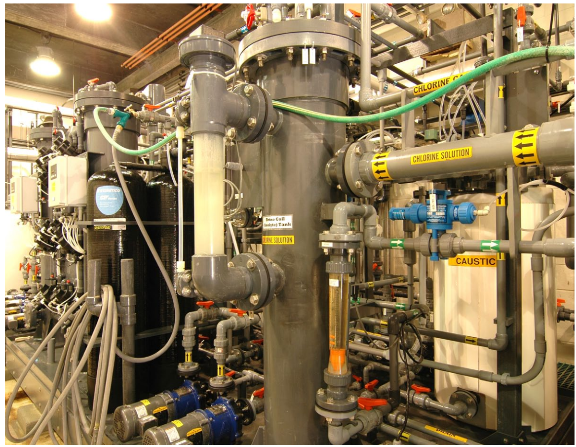
A new $2 million Klorigen Unit is now in operation at the Algiers Water Treatment Plant. The unit produces chlorine disinfectant on demand for the water treatment process by using food-grade salt and electricity. The driving force for using this system is risk reduction by eliminating the need to store tons of liquid chlorine onsite which could release to the atmosphere.