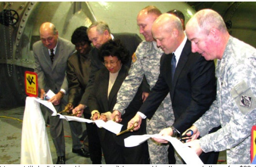
Mayor Mitchell J. Landrieu cuts a ribbon marking the completion of a $39.6 million project to repair drainage pumping stations throughout the City following Hurricane Katrina. In all, the Corps restored 23 S&WB pump stations and the Carrollton Frequency Changer Building to their Pre-Katrina levels of operation. Mayor Landrieu presided over the ceremonies with officials from the Corps, the Board and the City.

The Board of Directors, the engineering staff and the Corps work together in the best interest of the citizens to continue to improve a most crucial asset—the Board's massive drainage system.