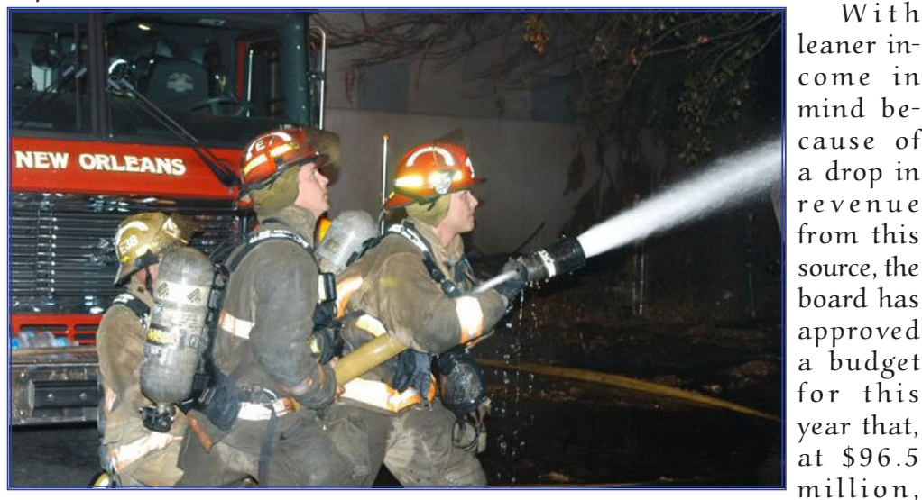
The S&WB was able to produce water for NOFD pumpers at the Algiers Plant which was not damaged.

ter distribution s y s t e m revealed some 3,900 leaks, many of which were from lines broken by tree roots when they were toppled by high winds. By