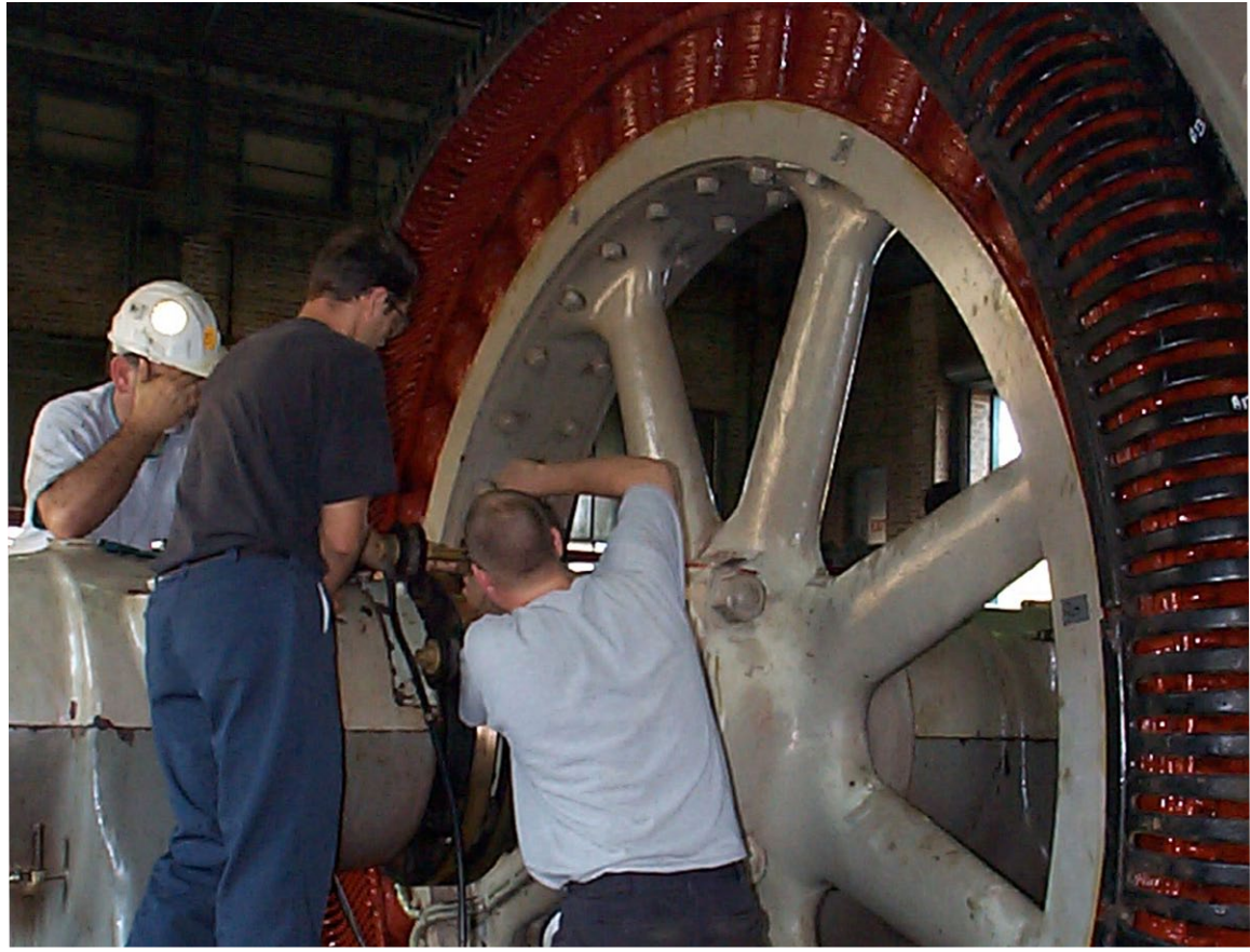
Flood waters from Hurricane Katrina submerged many of the giant motors which power the massive pumps of the S&WB's Drainage System. Within three days of the storm's passing, the Board had arranged for a team of experts from the General Electric Corporation to come to the City to work with S&WB staff to dry the motors and begin the re-winding process.