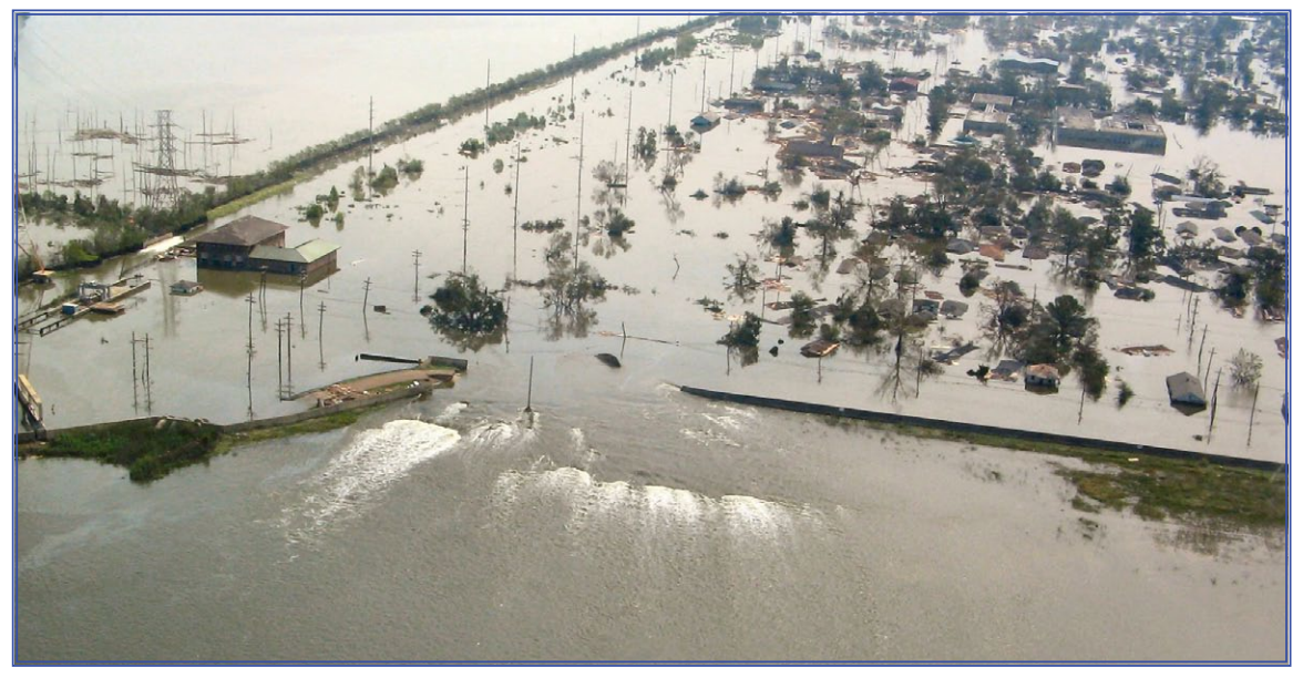
Breach in the Industrial Canal Flood Wall

tem through Central Control's radio system when all other forms of communications failed.